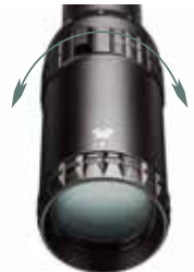
Rotate ring to adjust the magnification.

To change the magnification, turn the magnification ring to the desired level.